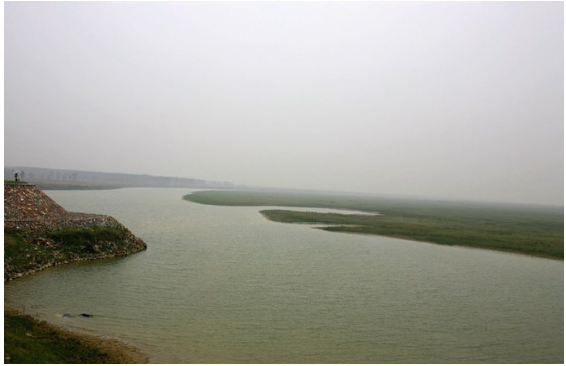
Zhengzhou Huanghe Shidi (CN338) is a wetland located in the lower reaches of the Yellow River, which is a wintering area for many waterbirds and Great Bustard Otis tarda .